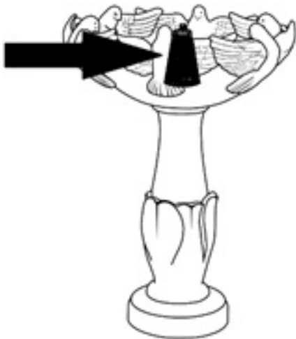
FT-294A (6 lbs) 9.5"W x 6.75" H